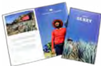
16 Page Informational Booklet