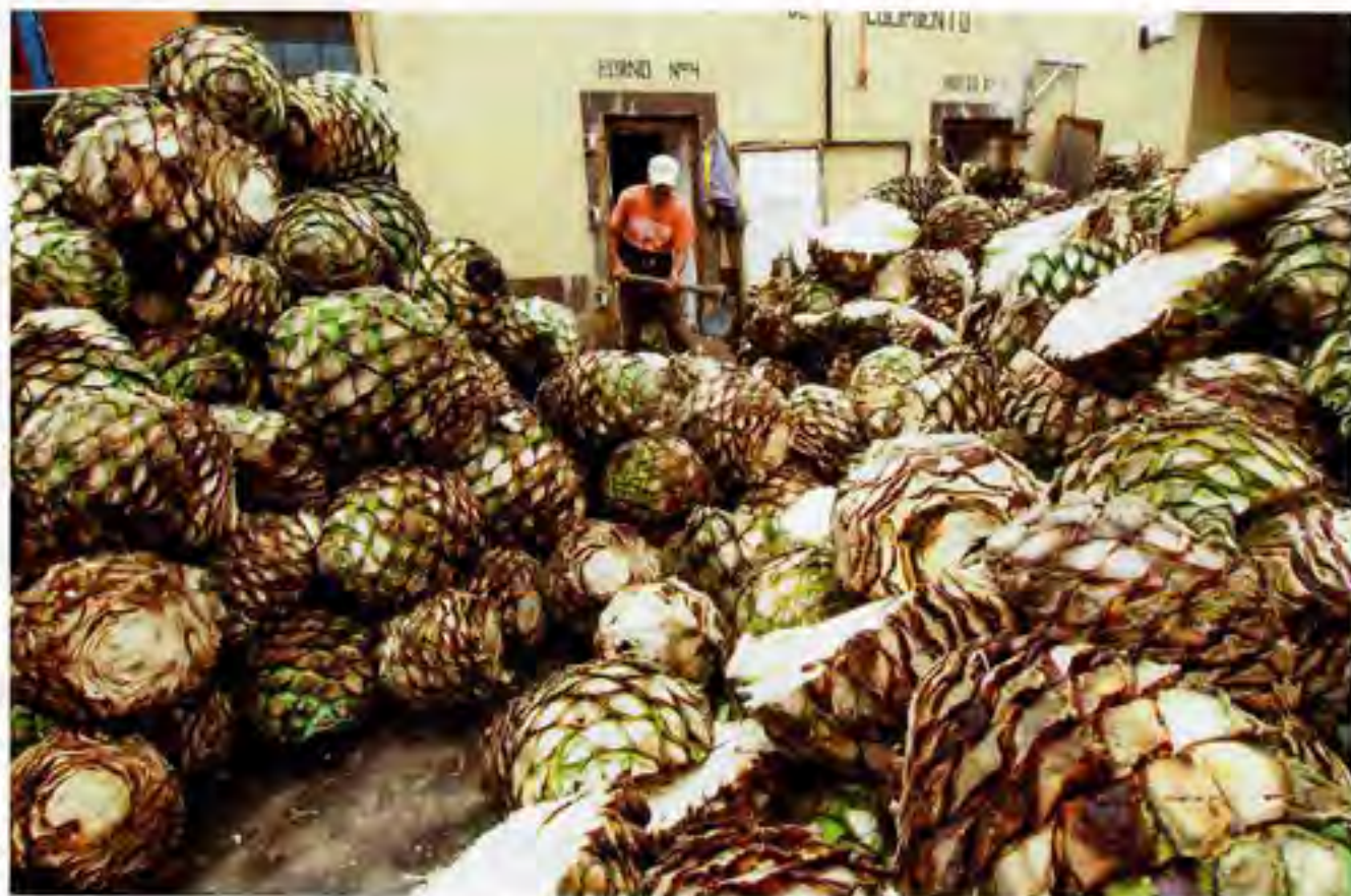
Para garantizar la mayor cantidad de azúcar en las "piñas", las plantaciones industriales cosechan los agaves justo antes de la floración, lo que impide la reproducción sexual del Agave tequilana .