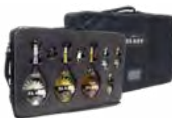
Presentation Display Case