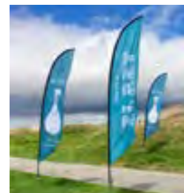
7' El Rey Flags