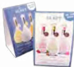
4" x 6" Table Tent Double Sided