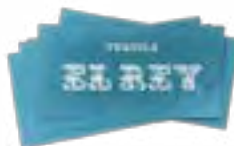
El Rey Stickers