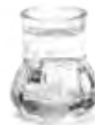
Crown shot glass Single or Four Pack