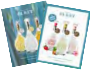
Flyers 8.5" x 11" Double Sided