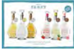
Posters 11" x 17"