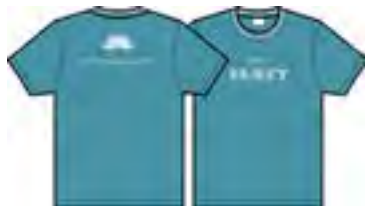
T-Shirt with logo Double Sided